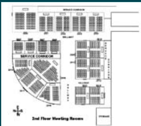
Exhibit Hall Map